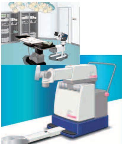
Development of cutting-edge technology in areas such as surgical assistance robots